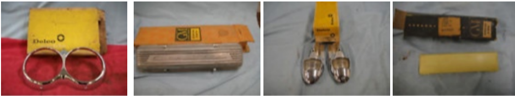
(Note: wrap text)

Rare Used Original Corvette Parts... 1960-61 F.I. Unit 7017320; 1958-59 Valve Covers Aluminum Low Script; 1959-61 Radiator; 1959-61 Aluminum Hi-Performance Top Tank Radiator; 1958-62 Heater Assembly; 1960 HD Rear Big Brake Shocks no. 5554593 (3-A-60); 1960-62 RPO-687 HD Brake and Suspension on Rolling Chassis; 1962 FI unit with air cleaner and distributor; 1962 F.I. engine with F.I. unit, distributor, air cleaner, dated T-10 transmission, 901/902 exhaust manifolds, starter, generator, bell housing, oil filter, canister and shifter, (rebuilt) – (dated J-4-1, stamped F1012RF – 2102515) photoed above, $22,500.00; 1965 FI unit w/ distributor and air cleaner; 1963-67 Convertible Vent Window Assemblies (1 pair); 1964-66 Teakwood Steering Wheel; 1965-66 Rear End Assembly FB 7-13-65; 1967 Rear End Assembly FB 11-22-66; 1966-68 Air Cleaner Lid (327-350 hp); 1967 Air Cleaner/Carb Stud with Tri-Power. Also have 1953-75 Hardtops, Bumpers, Suspension, Al Knoch Carpet, Seat Covers, Door Panels, Convertible Tops, Car Covers, Engine Blocks, Heads, Intakes, Exhaust Manifolds, Cranks, Pistons, Rods, Carbs, Distributors, and Tin for 1953 to 1972 Chevrolet and Corvettes (mostly). Too much to list or catalog. Email: fred@proteamcorvette.com