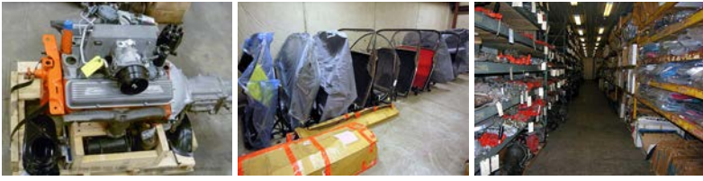
(Note: wrap text)

Rare Used Original Corvette Parts... 1960-61 F.I. Unit 7017320; 1958-59 Valve Covers Aluminum Low Script; 1959-61 Radiator; 1959-61 Aluminum Hi-Performance Top Tank Radiator; 1958-62 Heater Assembly; 1960 HD Rear Big Brake Shocks no. 5554593 (3-A-60); 1960-62 RPO-687 HD Brake and Suspension on Rolling Chassis; 1962 FI unit with air cleaner and distributor; 1962 F.I. engine with F.I. unit, distributor, air cleaner, dated T-10 transmission, 901/902 exhaust manifolds, starter, generator, bell housing, oil filter, canister and shifter, (rebuilt) – (dated J-4-1, stamped F1012RF – 2102515) photoed above, $22,500.00; 1965 FI unit w/ distributor and air cleaner; 1963-67 Convertible Vent Window Assemblies (1 pair); 1964-66 Teakwood Steering Wheel; 1965-66 Rear End Assembly FB 7-13-65; 1967 Rear End Assembly FB 11-22-66; 1966-68 Air Cleaner Lid (327-350 hp); 1967 Air Cleaner/Carb Stud with Tri-Power. Also have 1953-75 Hardtops, Bumpers, Suspension, Al Knoch Carpet, Seat Covers, Door Panels, Convertible Tops, Car Covers, Engine Blocks, Heads, Intakes, Exhaust Manifolds, Cranks, Pistons, Rods, Carbs, Distributors, and Tin for 1953 to 1972 Chevrolet and Corvettes (mostly). Too much to list or catalog. Email: fred@proteamcorvette.com