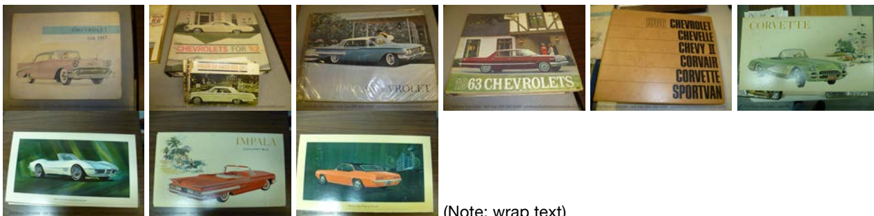
(Note: wrap text)

1967 Corvette 435 HP Display Motor... 3904351 four-bolt main block complete with intake, carbs, air cleaner, heads, distributor, shielding, braided wires, exhaust manifolds, alternator, water pump, cooling fan, valve covers and oil pan. This is a display motor from ProTeam Corvette in Napoleon, Ohio. $5,995.00 plus shipping and crating . Click here to see the gallery of photos. Contact terry@proteamcorvette.com . Others available.