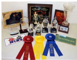
(Note: wrap text)

Corvette For Sale Form at: CorvettesWanted.com