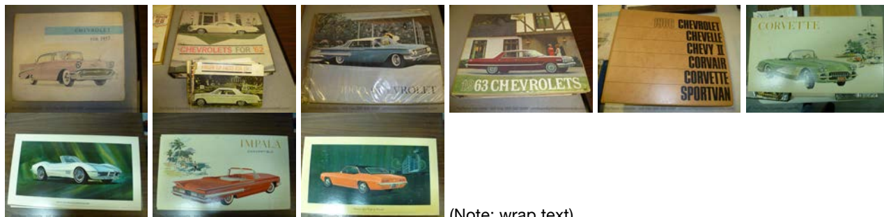
(Note: wrap text)

For more information and photos, please click on our stock numbers or email: terry@proteamcorvette.com