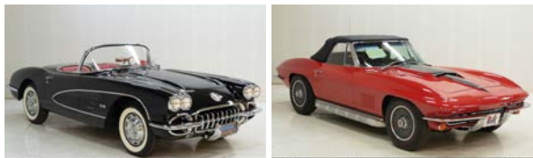
Year End Sale 2019 Year End Sale 2019