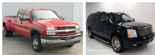
(Note: wrap text)

Corvette Memorabilia For Sale... Dealer showroom 18"x 32" hardboard posters $100.00 to $500.00 each (years available: 1960 Corvette, 1969 Corvette Convertible, 1970/72 Corvette TTop, 1972 Corvette TTop w/1953 inset, 1973 Corvette TTop, 1975 Corvette TTop, 1960 Red Impala Convertible, 1969 Camaro Sport Coupe, 1982 Chevy Stepside Pick-up w/1982 Chevy Fleetside Pick-up, 1982 Chevy S10 Sport Pick-up w/1982 Chevy S10 Tahoe Pick-up) – Dealer showroom albums (years available: 1960, 1962 with fingertip fact book, 1963, 1964, 1966 with fingertip fact book, 1967, 1968, 1969, 1973 with salesman product information, and 1975) $400.00 to $500.00 each – Corvette News/Corvette Quarterly collection (complete) – Dealer promo models – Miniature scale models – Blue Bars collection – Good Times collection – Corvette Restorer collection – Corvette Driveline collection – Keeping Track of Corvettes collection – Vette Vues collection – Corvette American Legend collection – Bloomington Gold Special Collection Booklets – Corvette owners manuals – Corvette sales brochures – Corvette assembly manuals. Hundreds of out of print books and magazines. Questions? Email terry@proteamcorvette.com