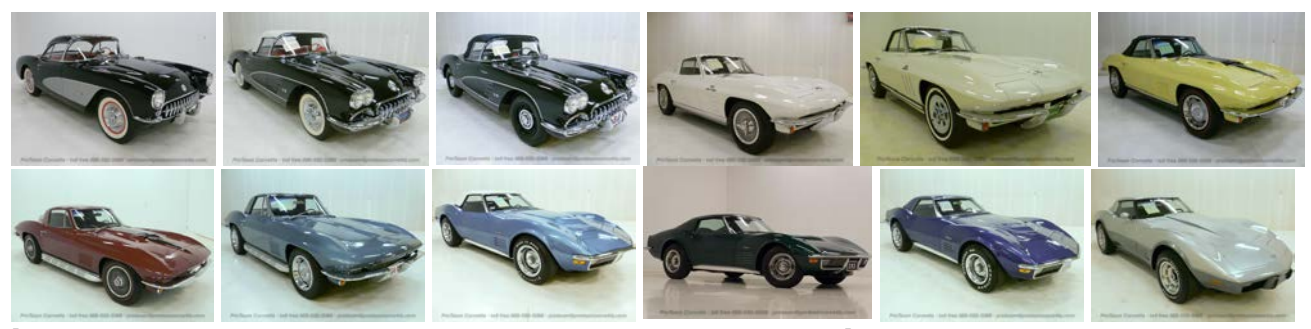
[list images horizontally along left side of content- below header]

These Corvettes range from 1957 to 1978 and will remain in Napoleon, Ohio until early May and are available for pre-auction inspection.