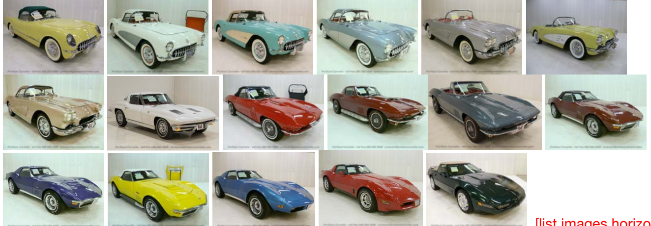
along left side of content- below header]